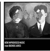
Paisaje Sebastián Greschuk (ears&eyes) El Contorno Del Espacio